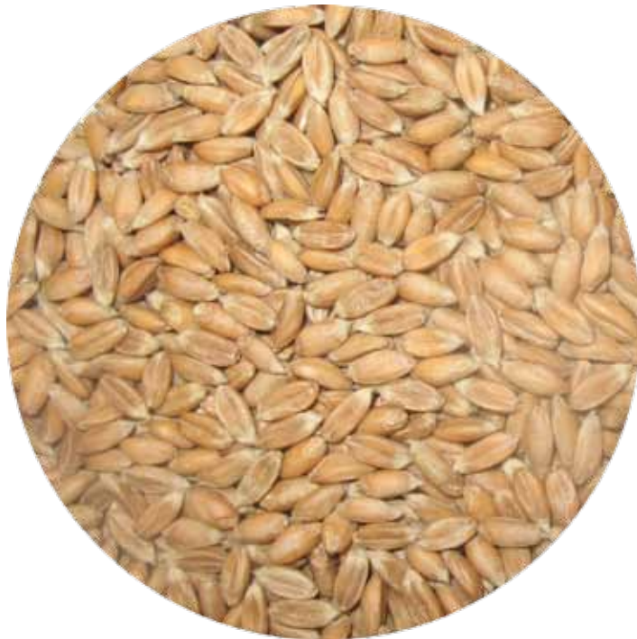
Spelt wheat, debulled.