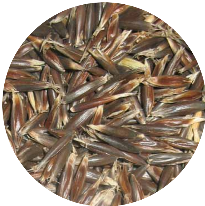
Black feed oats (Avena strigosa L.).

To be consumed by humans, hulled oat varieties must be dehulled first. The dehulling process differs slightly from dehulling barley because oats are higher in lipids (fats) than all other grains. This can cause the abrasion wheel to plug up and not be completely effective. An oat dehuller functions by dropping the hulled oats inside a large spinning closed container that encloses another spinning stone. On contact with this stone, the hulls are separated from the groats (the inside portion of the oat kernel). The lighter hulls are then blown off and the dehulled groats are collected. As with dehulled barley, oats can be pearled.