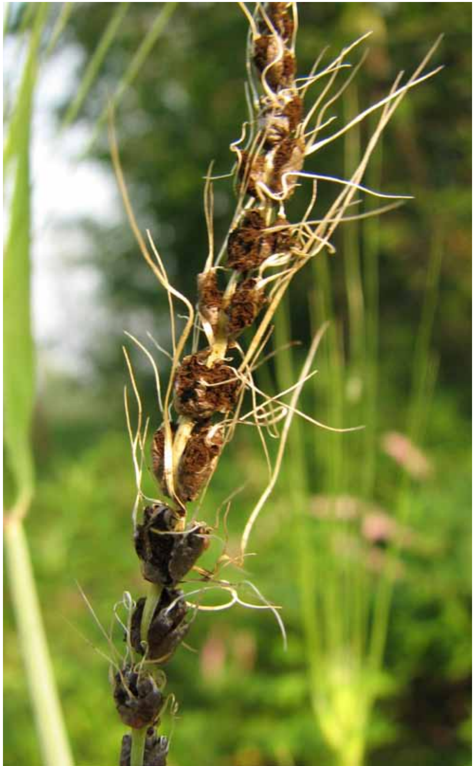
Smut on barley.

Other fungal diseases such as barley loose smut ( Ustilago nuda ), oat loose smut ( Ustilago avenae ) and wheat loose smut ( Ustilago tritici ) form loose, powdery brown masses in place of the seedhead, earlier than normal heads. They are especially prevalent on all hullless grains, wheat, rye, and triticale. These fungal spores are then blown around to infect the forming seed on the rest of the crop. Leaf blotch ( Scolecotrichum graminis )