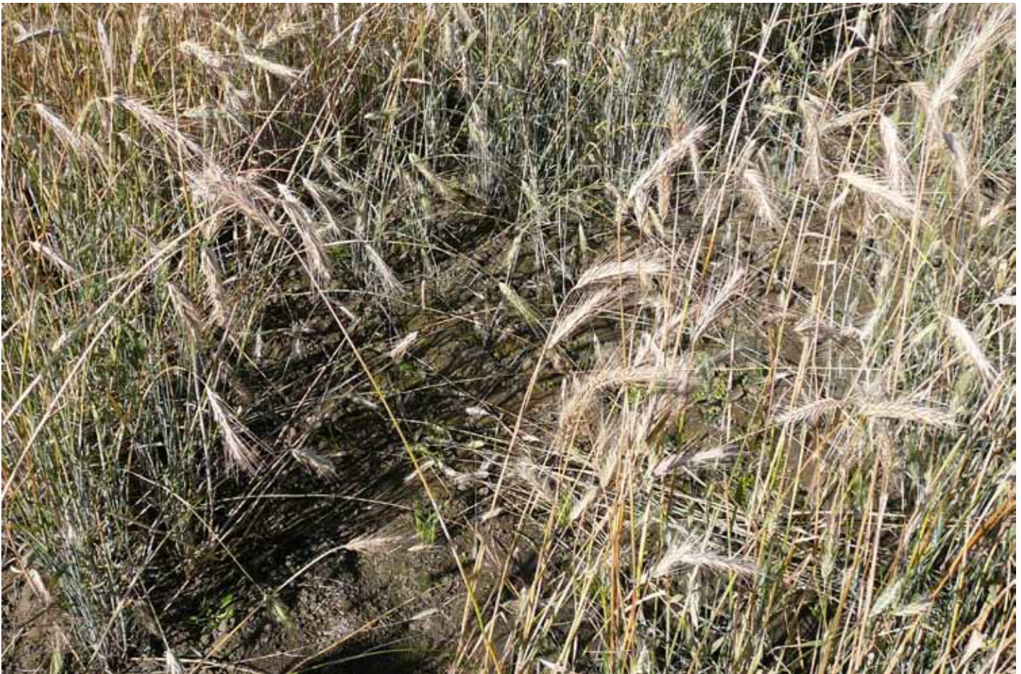
Bebral winter rye.