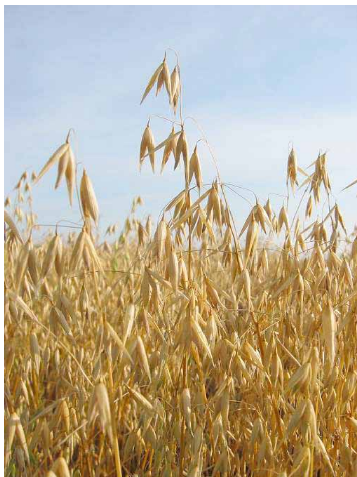
Close-up of ripe oat heads.

Oats ( Avena sativa ) are the second-most important grain crop for Alaska, after barley. They are also well adapted to the long day length and short growing season found here. Oats are 7 to 10 days later in maturing than the early season barley varieties. Oats can be planted early in the season in areas that are poorly drained, as oat seed germinates well in cold and wet soils. Oats are also more tolerant of acidic soils than barley or wheat and can produce high yields when soil pH values range between 5.0 and 5.5. There are many different types of oats; feed oats which include common (or white) oat ( Avena sativa L.), black oat ( Avena strigosa L.) and red oat ( Avena byzantina C. Koch), and hulless oat ( Avena nuda L.). Oat straw lacks the rough awns of barley straw so there is a high demand for use as animal bedding, especially with the local dog mushers. Seeds from feed oats have the hulls still attached but the hull from hulless varieties detaches from the kernel when harvested, exposing the embryo and leaving a hulless or naked kernel.