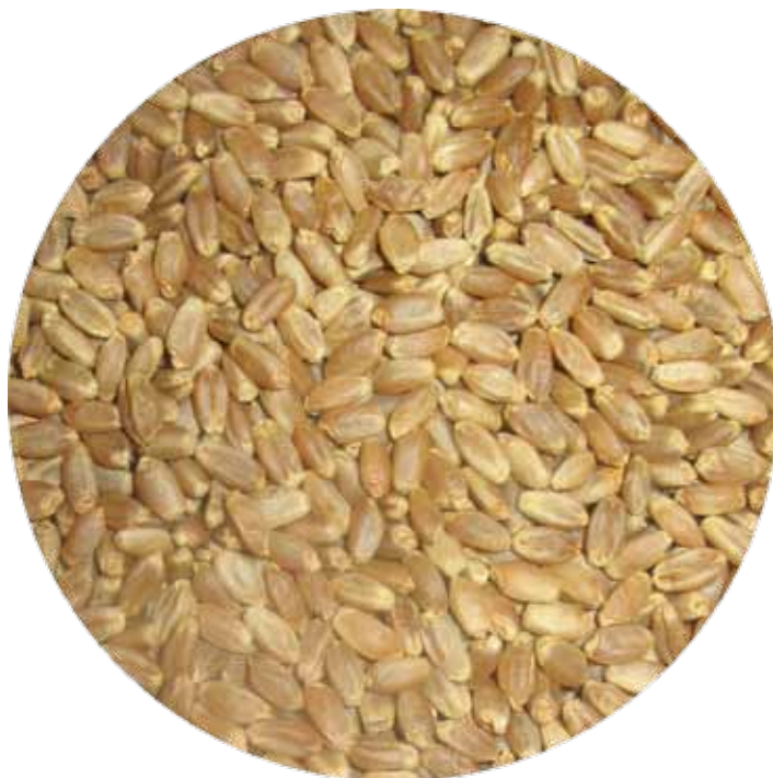
Hard red spring wheat.

endosperm) is preferred for baking confectionary products. Secondary uses for wheat are for non-ruminant animal feed (cracked or rolled), or for poultry diets (whole grain).