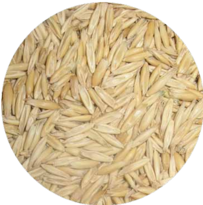
Yellow feed oats.