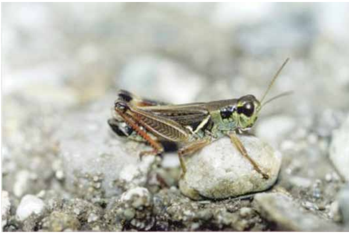
Grasshoppers. From top to bottom: northern grasshopper, Melanoplus borealis ; female migratory grasshopper, Melanoplus sanguinipes ; male migratory grasshopper on barley head.