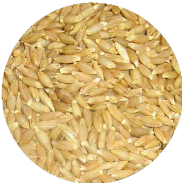
Hulless barley grains.